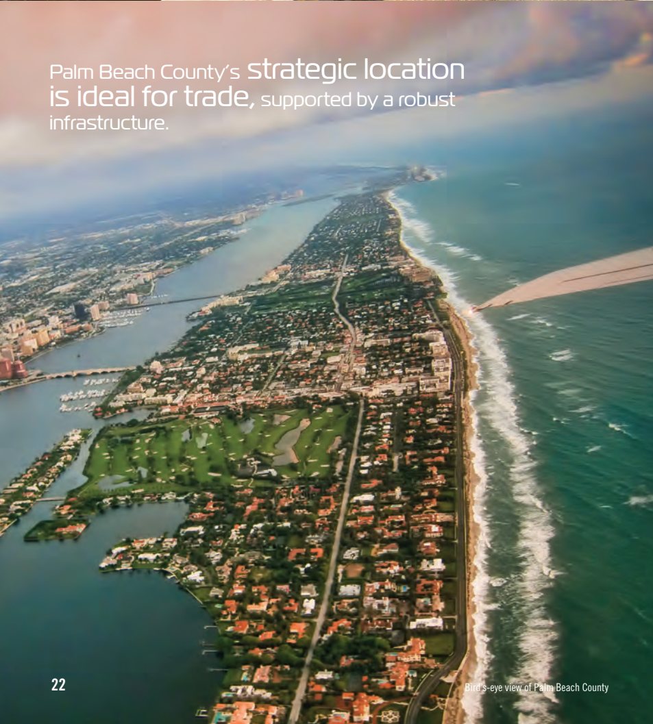
Bird's-eye view of Palm Beach County

Palm Beach County's strategic location is ideal for trade, supported by a robust infrastructure.