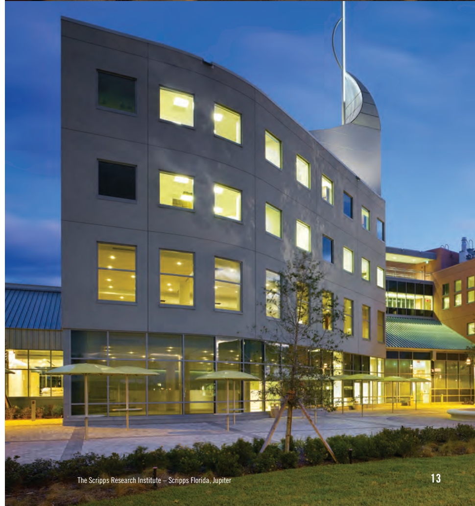
The Scripps Research Institute – Scripps Florida, Jupiter