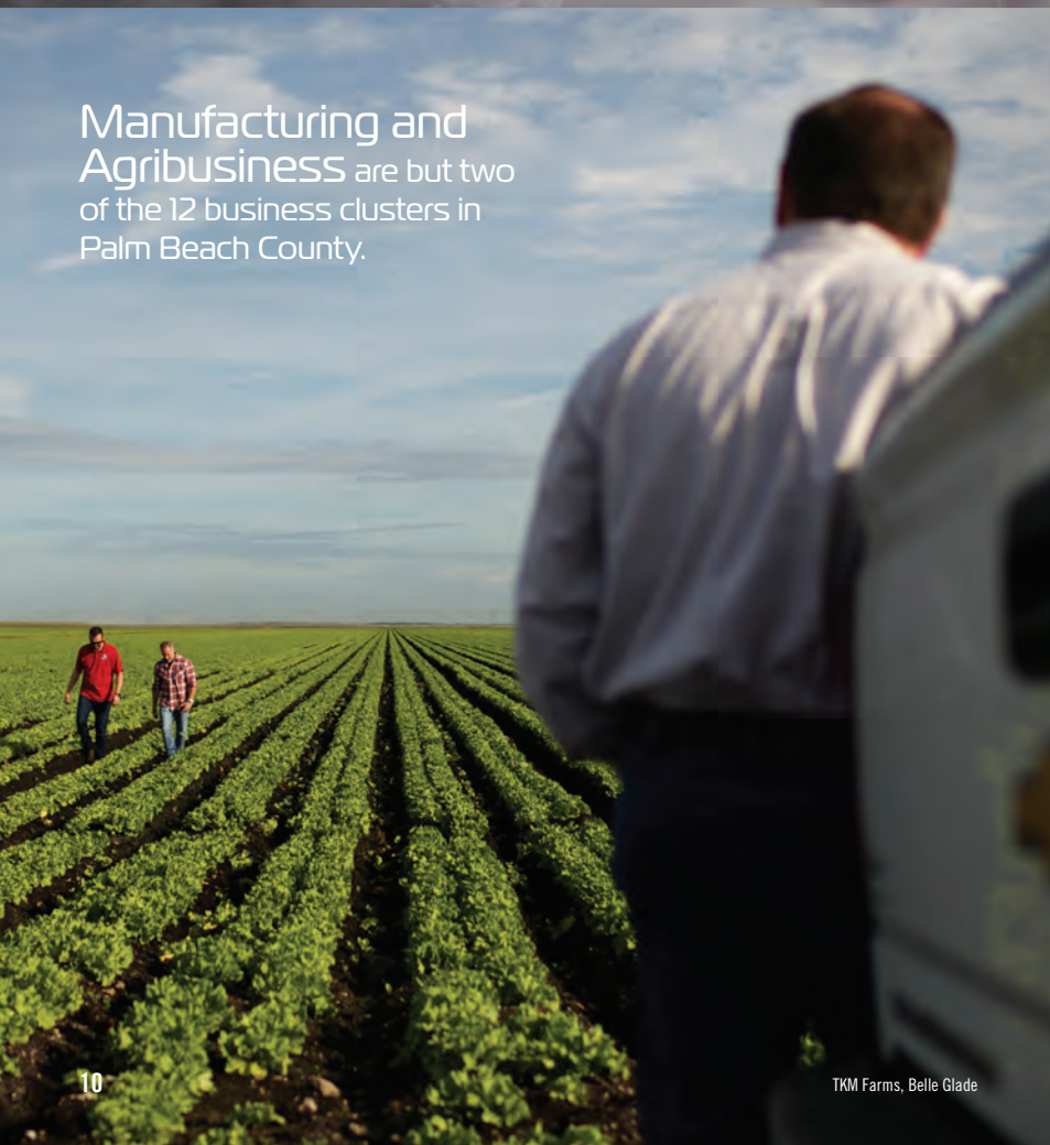
TKM Farms, Belle Glade

Manufacturing and Agribusiness are but two of the 12 business clusters in Palm Beach County.