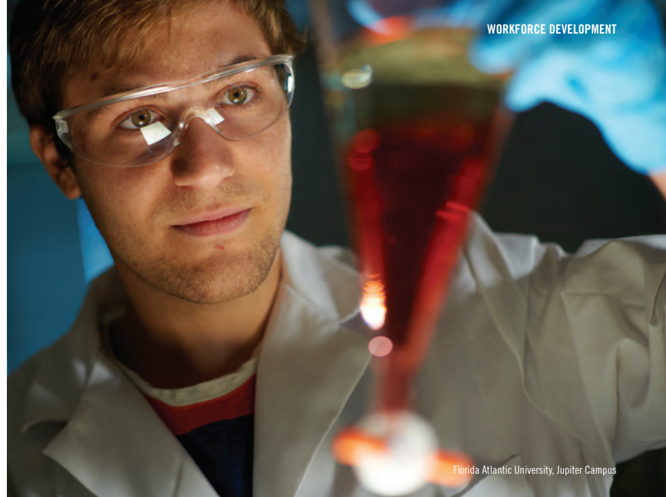
Florida Atlantic University, Jupiter Campus

The School District of Palm Beach County (SDPBC) is the eleventh-largest in the nation and the fifth-largest in the State of Florida with 185 schools, serving more than 183,000 students who speak 150 languages and dialects. As the largest employer in Palm Beach County, the school district has nearly 21,000 employees, including more than 12,000 teachers.