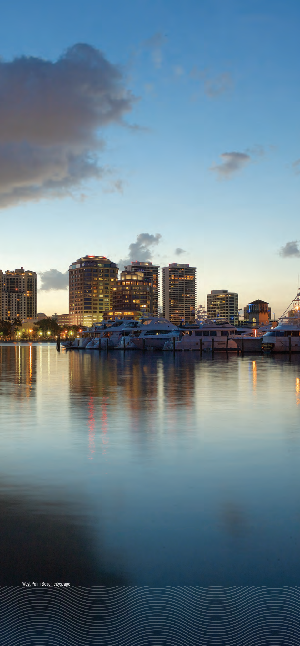
West Palm Beach cityscape