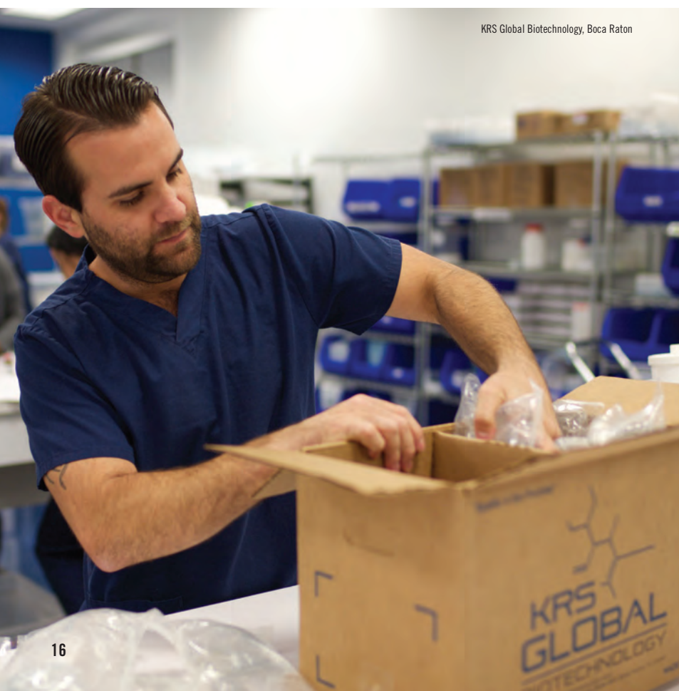
KRS Global Biotechnology, Boca Raton

Contact: Manager, Capital Programs, Enterprise Florida, 407.956.5607 www.enterpriseflorida.com