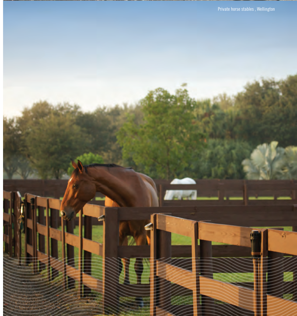
Private horse stables, Wellington