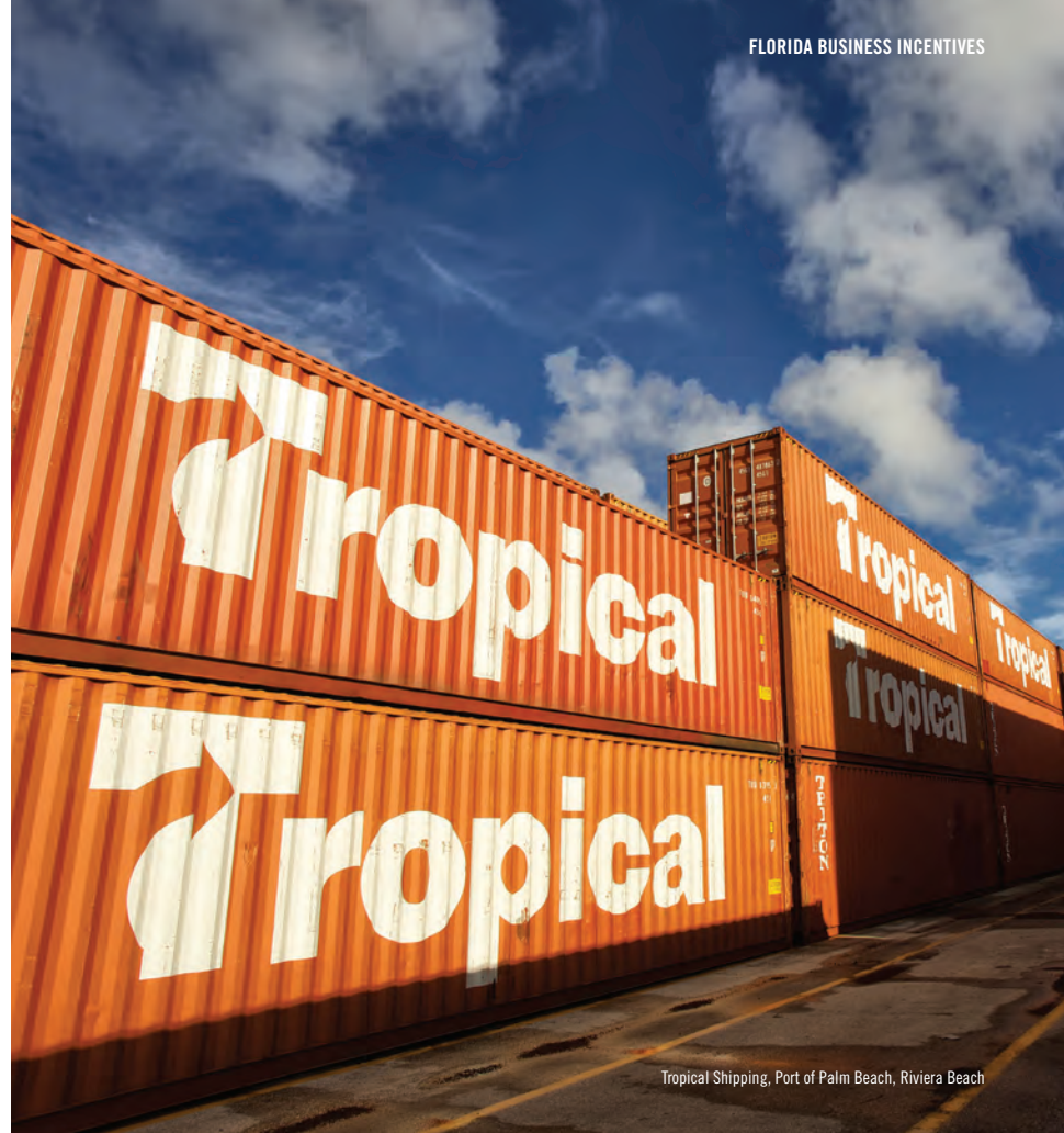
Tropical Shipping, Port of Palm Beach, Riviera Beach