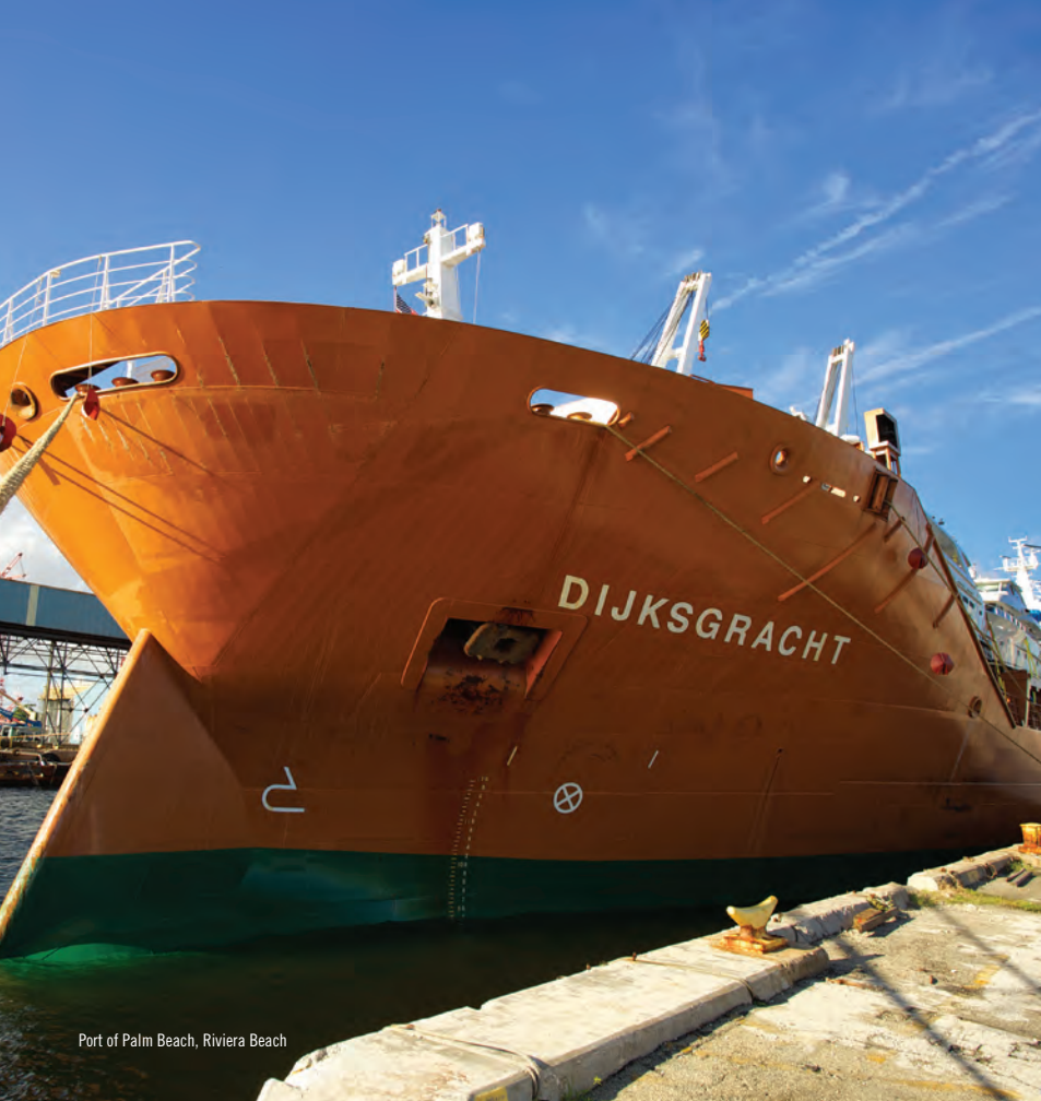
Port of Palm Beach, Riviera Beach

Palm Beach County's strategic location is ideal for trade, supported by a robust infrastructure.