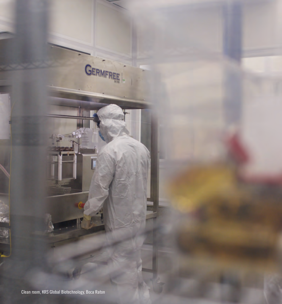
Clean room, KRS Global Biotechnology, Boca Raton

Manufacturing and Agribusiness are but two of the 12 business clusters in Palm Beach County.