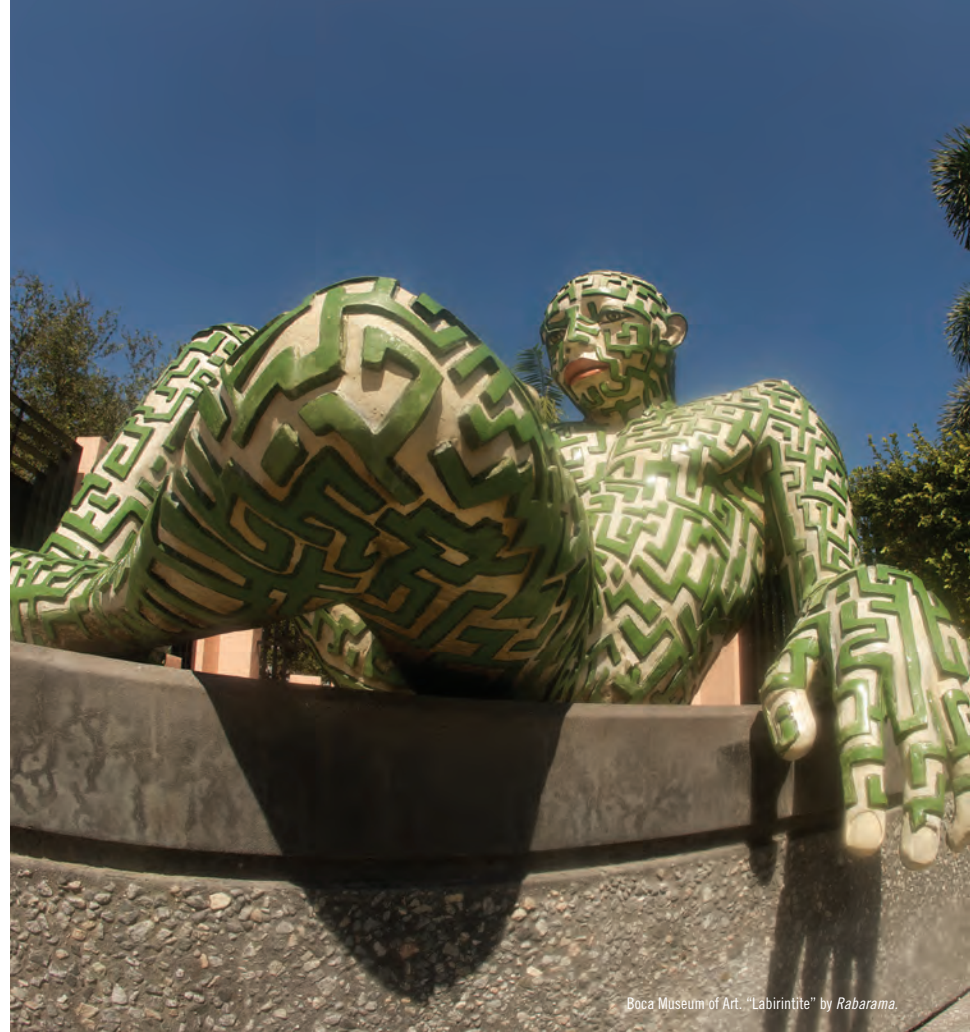
Boca Museum of Art. "Labyrinth" by Rabarara.

The Winter Equestrian Festival (WEF), held at the Palm Beach International Equestrian Center (PBIEC), is the largest and longest-running circuit in horse sport, a 12-week show jumping competition for hunters, jumpers, and equitation held annually from January through April.