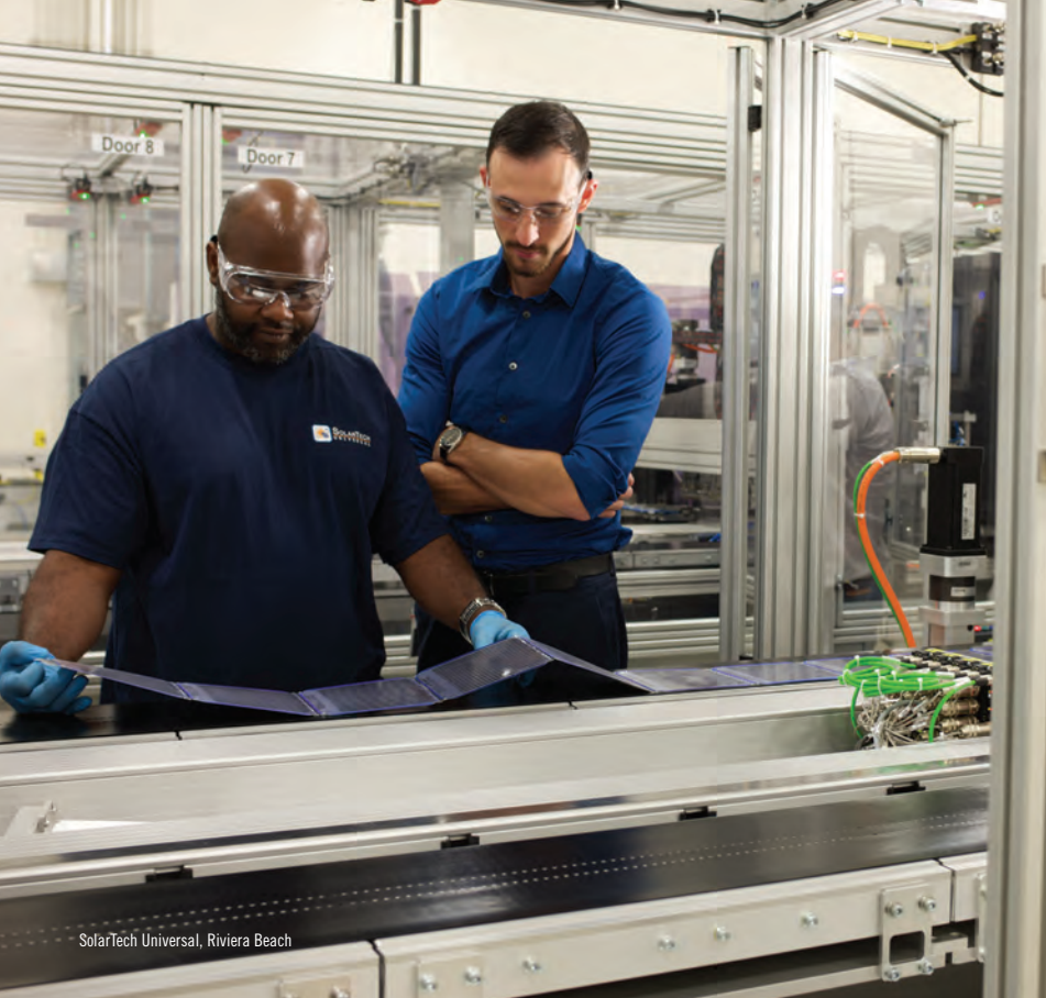
SolarTech Universal, Riviera Beach